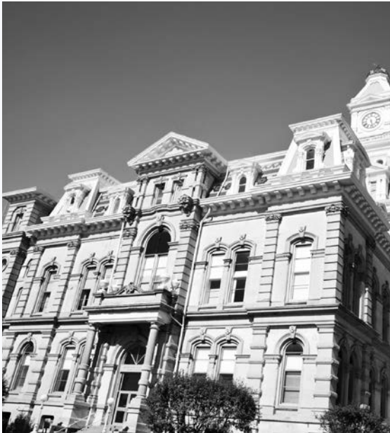
MUSKINGUM COUNTY COURTHOUSE