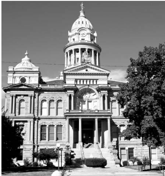
MIAMI COUNTY COURTHOUSE