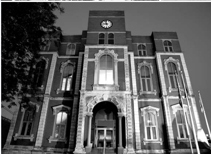
OLD COURTHOUSE IN DEFIANCE