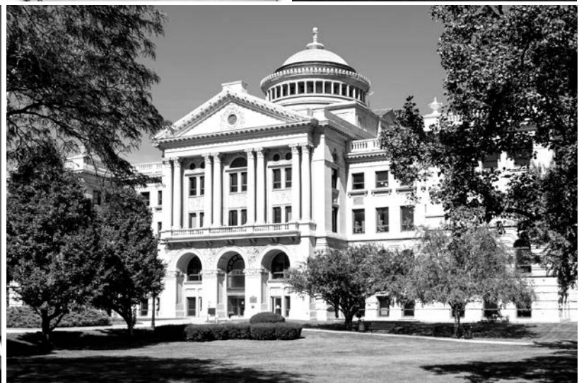
LUCAS COUNTY COURTHOUSE