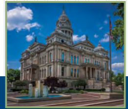
Miami County Courthouse, Troy, Ohio